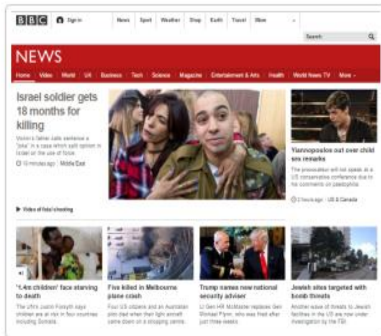
BBC News website homepage

The cite BBC Watch controlled this headline ,the original one was : Israel soldier gets 18 months for killing ,after a few minute it has been changed to the headline above that is to say, BBC uses this strategy to avoid being blamed by BBC WATCH .