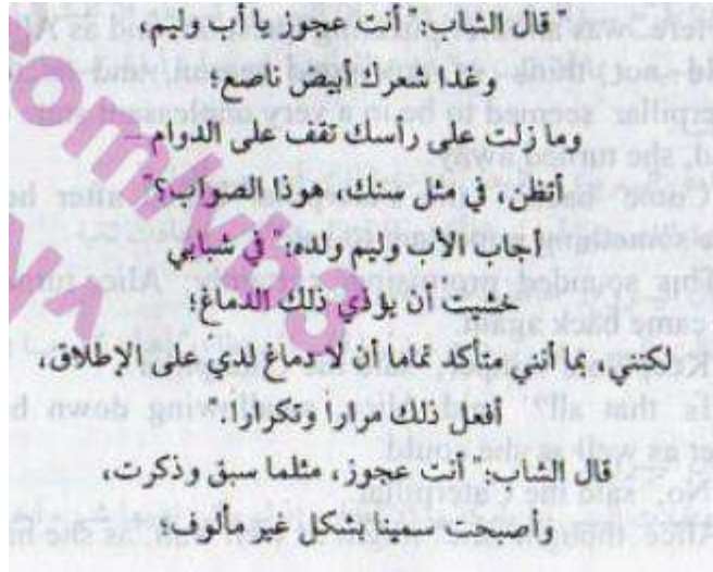
Figure3: Alice's song the poem of "You are old, Father William". P.86