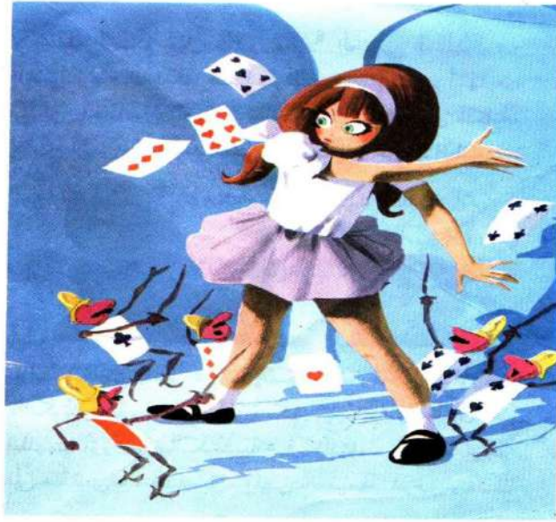
Figure4: A picture from Alice in Wonderland submitted to primary school.